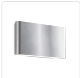
AT68010-BN-UNV Brushed Nickel