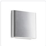
AT68006-BN -UNV Brushed Nickel