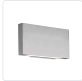
AT67010-BN-UNV Brushed Nickel