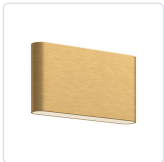
AT6510-BG-UNV Brushed Gold